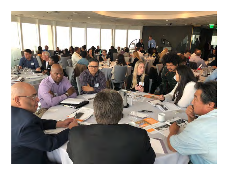
Human Resiliency Institute at Fordham (Gabelli School of Business) • Edge4Vets.org